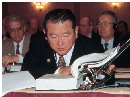
Delegates pore over a huge book of proposed legislation.

The massive job required a grand total of 1,120,000 impressions, including printing, collating and three-hole drilling. Finished sets were inserted in ring binders with color-coded covers and spines to differentiate the various languages. Completed books were delivered to Rotary International's headquarters in Evanston and to the meeting site at the Chicago Marriott Downtown hotel.