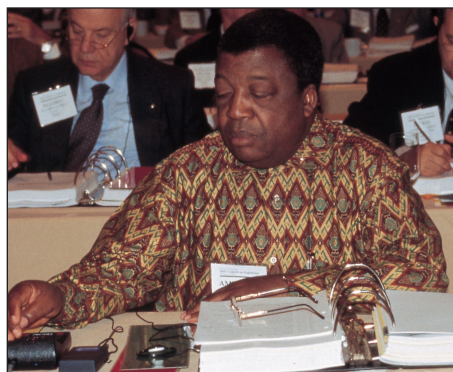
Electronic units speed the legislative voting process.

A total of 523 delegates from 65 countries pored over a record-setting 631 items during the six-day meeting.