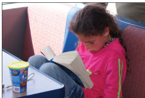
Enthusiastic young Harry Potter readers like this one have dispelled the notion that children don't read books anymore.

books have already turned up on online auctions as collectors' items.