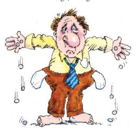
After taxes, it's all I have left.