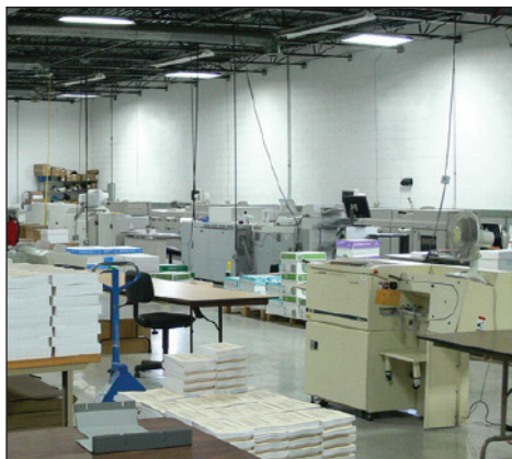
Copresco's new color-corrected 5000K lighting system saves energy and enhances our color-management capabilities.

Toner, unlike the petroleum-based ink used in offset and inkjet printing systems, is inert and harmless.