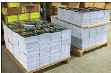
Copresco ships carloads of books and manuals by truck, air, package express and courier to single and multiple locations.

We wish you a most happy holiday season and hope to share another successful year with you in 2012.