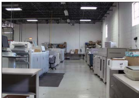
Copresco's digital black & white and color presses were back in action, producing clients' jobs just 48 hours after the July storm.

We wish you a most happy holiday season and look forward to sharing another highly successful year with you in 2013.