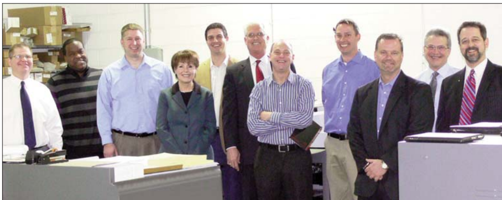
Employees of Kansas' Blue Valley School District #299 check out Copresco's new digital presses during a plant tour.