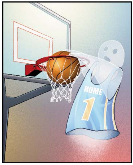
you so," the coach said after the game. "All we needed was a little school spirit."

The three-foot-tall ghost flew effortlessly up in the air with the basketball and sank the winning shot at the buzzer. The crowd cheered wildly as the school team won its first game in years. "I told