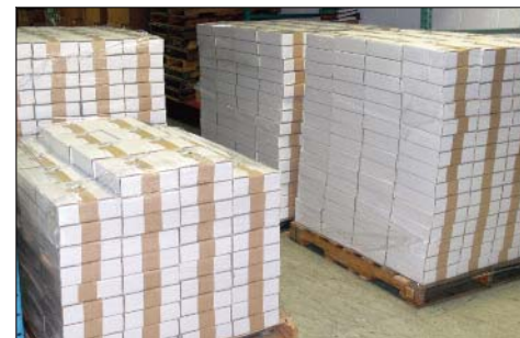
Pallets stacked with books are ready for shipping by Copresco.

Copresco is located smack dab in the middle of the continent, so we have access to the whole world.