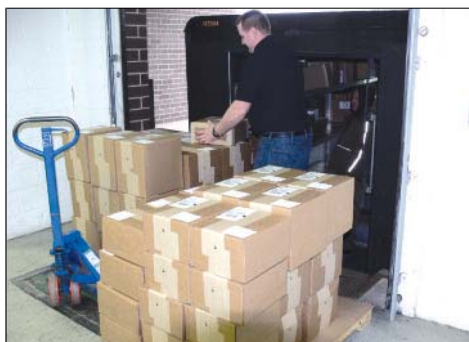
Copresco ships tons of publications, books and manuals to destinations across the country and across the globe.

on the website just to save printing and shipping costs. Your customers won't appreciate it.