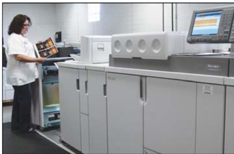
A project is completed on Copresco's newest digital color press.

Our continuing goal is to combine tasteful humor with helpful technical information and industry news.