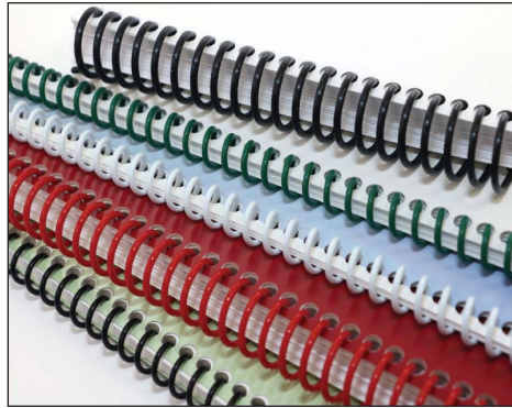
Colorful coil bindings add durability and style for client projects.

Coil binding allows books to lie flat for easy referencing and note taking.