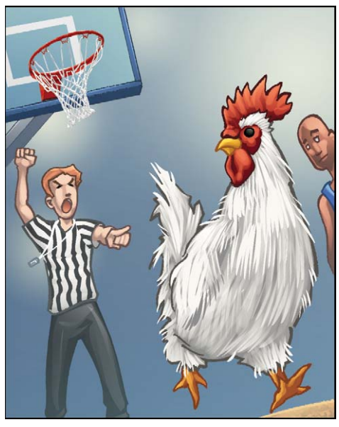
A: Because the referee called a fowl!

Q: Why did the chicken cross the basketball court?