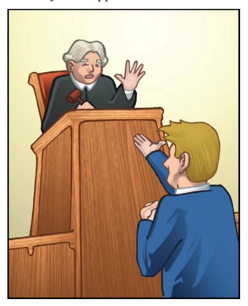
Defendant: "Your Honor, when I find someone I admire, I like to give him all my business."

"Young man, this is the fifth time this month you've appeared before me."